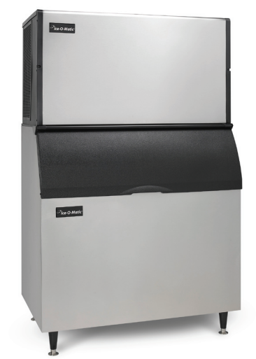
ICE1806 on B100